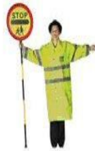
All vehicles must stop

Please confirm you are able to meet these requirements.