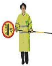
Barrier to stop pedestrians crossing